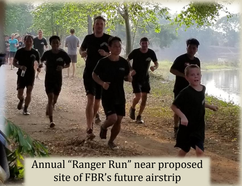
Annual "Ranger Run" near proposed site of FBR's future airstrip

We head back to Alaska in a few weeks for our fourth season of instructing with Kingdom Air Corps. This year I will be working primarily with instrument students. July will see another round of Brooks Range Bible Camp, the summer camp KAC puts on each year for the children of Alaska's northern villages. BRBC is a highlight of our summer as we watch the kids surrender their hearts to Jesus and begin their journey of faith. Please pray for us this summer as we help future missionaries hone their skills in flight and evangelism.