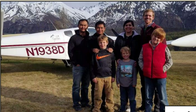
Our family picture including two Thai uncles!