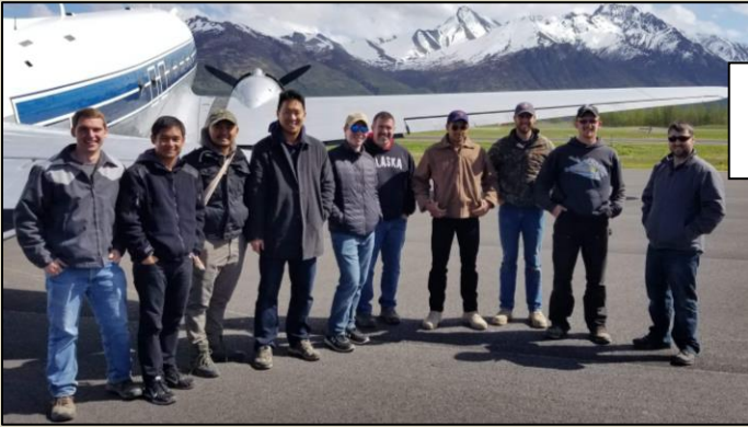
A group of our 2019 students and instructors in front of KAC's DC-3 at our hangar in Palmer, AK