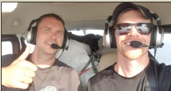
Our ultimate goal is to see aviation bring needed help to the oppressed people of Burma. We realize the magnitude of this goal and the marathon-like mentality necessary to see it happen. We are excited to partner with FBR during this foundational time of development.